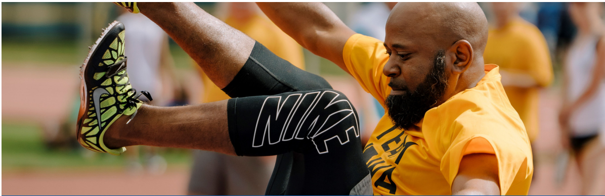
Team Iowa 2024 TRANSPLANT GAMES OF AMERICA