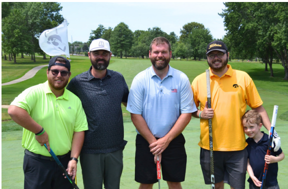
Iowa Transplant Open FINKBINE GOLF COURSE