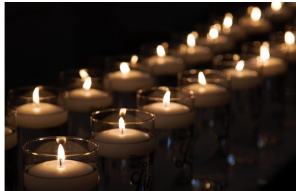
Candlelight Tributes CENTRAL & EASTERN IOWA AND VIRTUAL