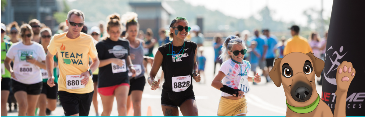
Give Life 5K FORMERLY GREEN 5K